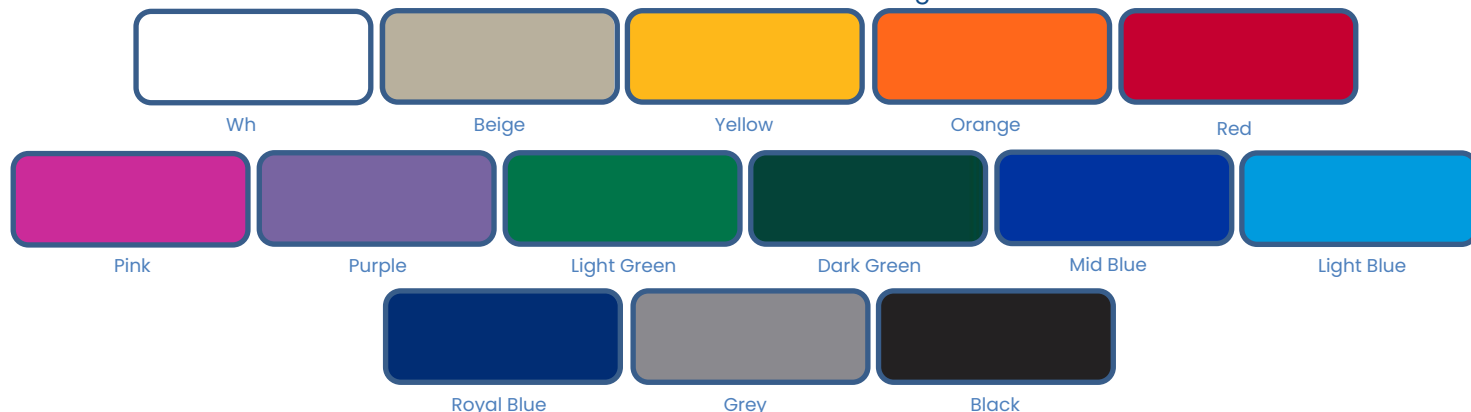
PK610 Multicover Colour Range

Colours are a representation and may differ from the actual colours