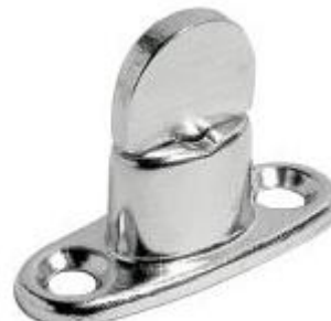
896 – 10mm Turnbutton A: 10mm B: 22mm C: 23mm