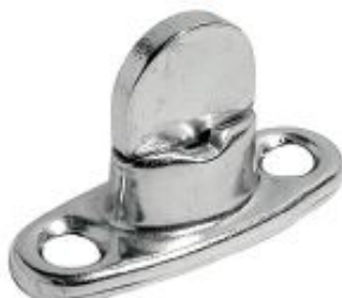
895 – 8mm Turnbutton A: 8mm B: 20mm C: 23mm