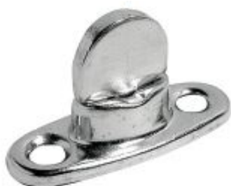
894 – 6mm Turnbutton A: 6mm B: 18mm C: 23mm