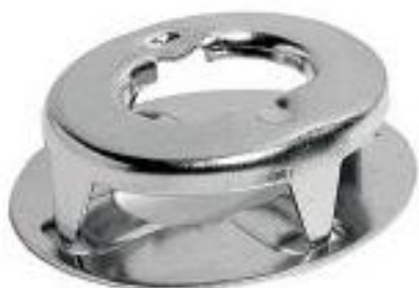
897 – Eyelet & Clinch Plate

Commonly found on boat covers and vintage car hoods, a Paskal Turnbutton is essential for any marine or automotive repair kit.