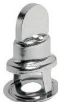
893T – 7mm Cloth/Cloth & 892-3 clinch plate